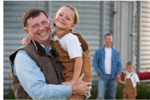
Ag Town Turn Around helps agricultural communities develop a sustainable future

Total Liabilities and Net Assets 4,727,382