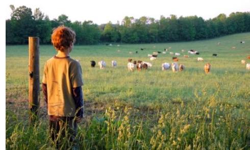
Kids on the Land plants the seeds for a sustainable life on the land