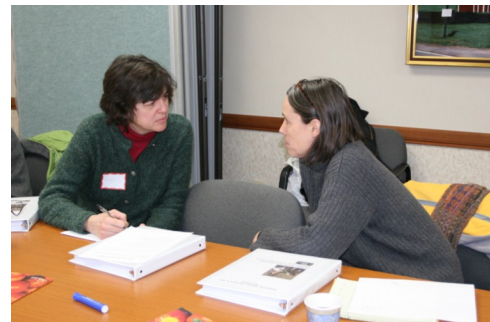
Our Beginning Farmers & Ranchers: program teaches women how to build successful businesses