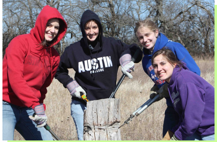
Austin College student's participate in Gen Next, a program partially funded by donations